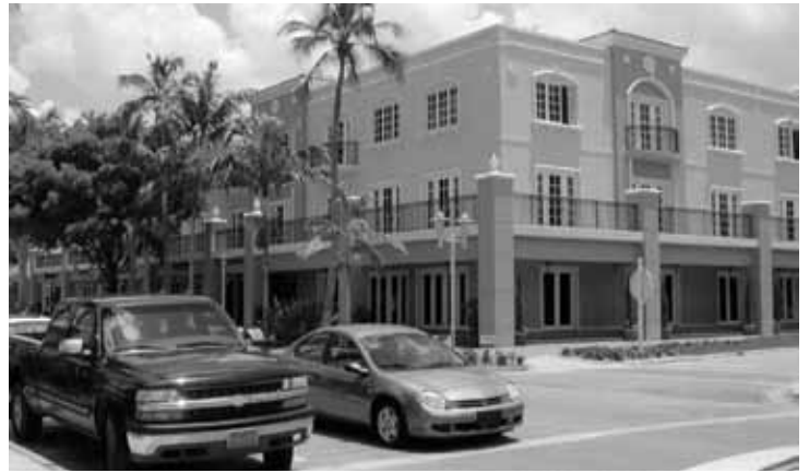
fig. 3 — Fifth Avenue South in Naples