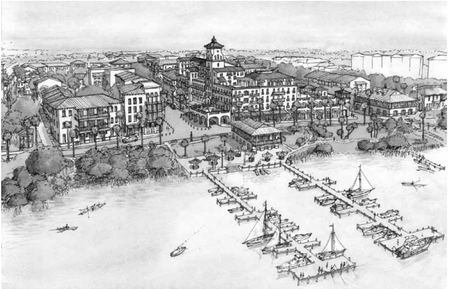
fig. 6 — Osprey waterfront proposal in Sarasota County [Dover, Kohl & Partners]