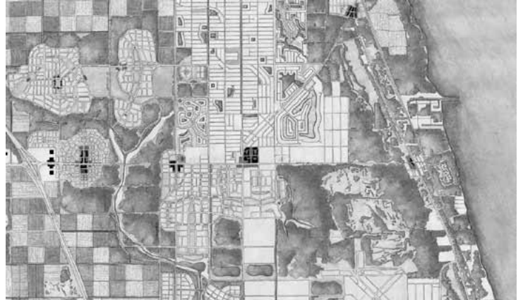
fig. 5 — North St. Lucie County [Treasure Coast Regional Planning Council]